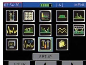
Main Menu(DVB-C and DVB-T)