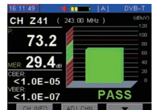
DVB-T Power and MER