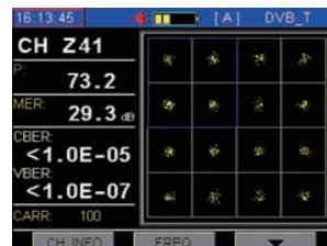
DVB-T Constellation Diagram